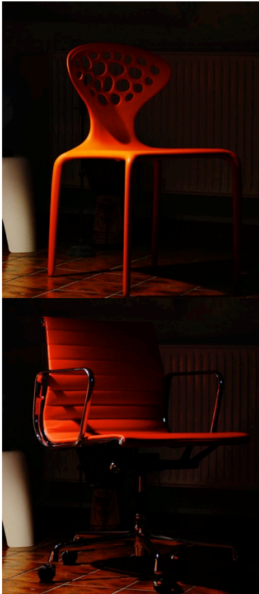
Figure 2: Which of the two seems to generate a greater feeling of life in you? Which of the two makes you more aware of your own life? Which of the two induces a greater harmony in you, in your body and in your mind? As with the two chairs (Lovegrove Supernatural (top) Eames EA 117 (bottom)) in this example, Alexander [2 p355] shows that the quality of life is a universal property of everything.

designers might look at initially. Some have suggested considering the context as a resource for solutions; others proposed design processes that are more agile and iterative to adjust to the interaction between the designed artifacts and their contexts.